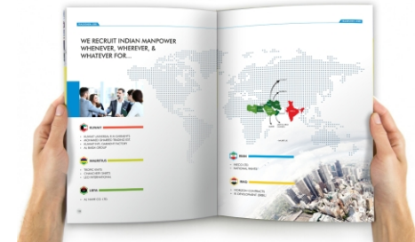
Brochure | Tradesmen Jobs